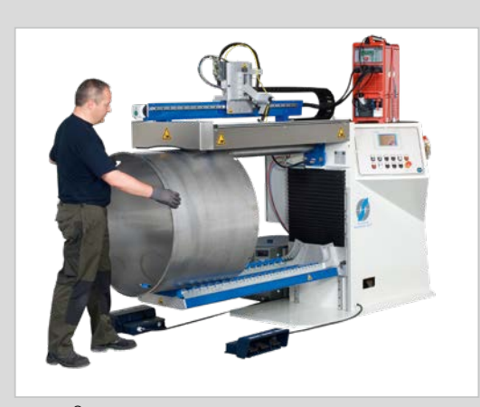
ELENA® 1100-II-HE with insertion aid